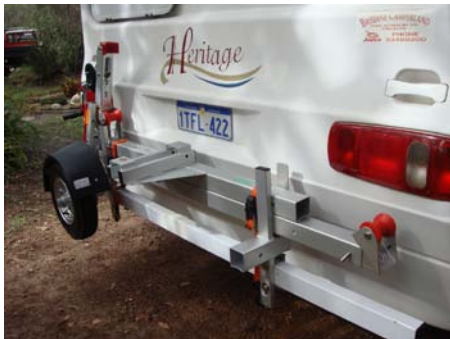
Axle shown mounted horizontally, You can also mount it vertically.