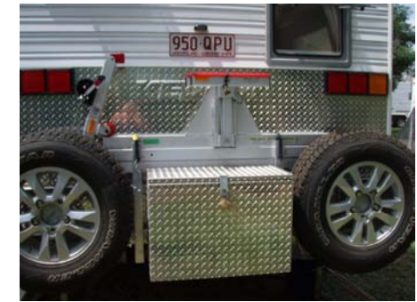
Kedron c/van with toolbox. Customer extended c/van brackets to suit.