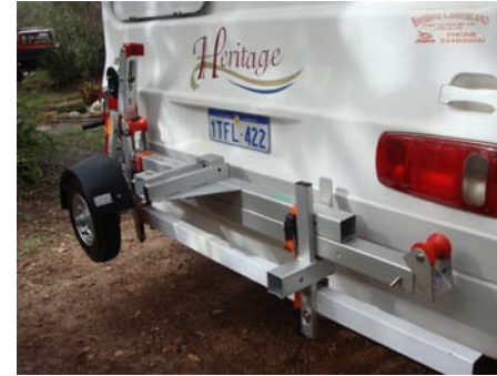
Axle shown mounted horizontally, You can also mount it vertically.